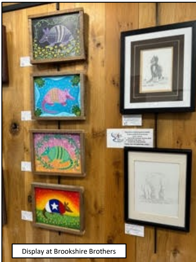
Display at Brookshire Brothers