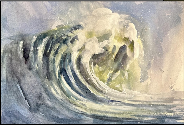
Big Sur