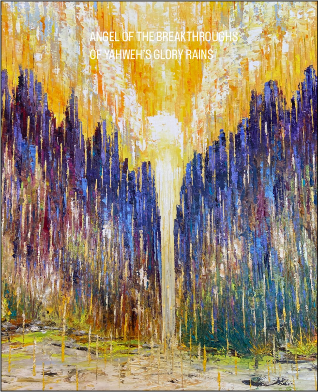
ANGEL OF THE BREAKTHROUGHS OF YAHWEH'S GLORY RAINS